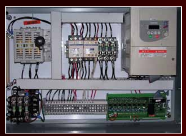
Advantage end truck control panel