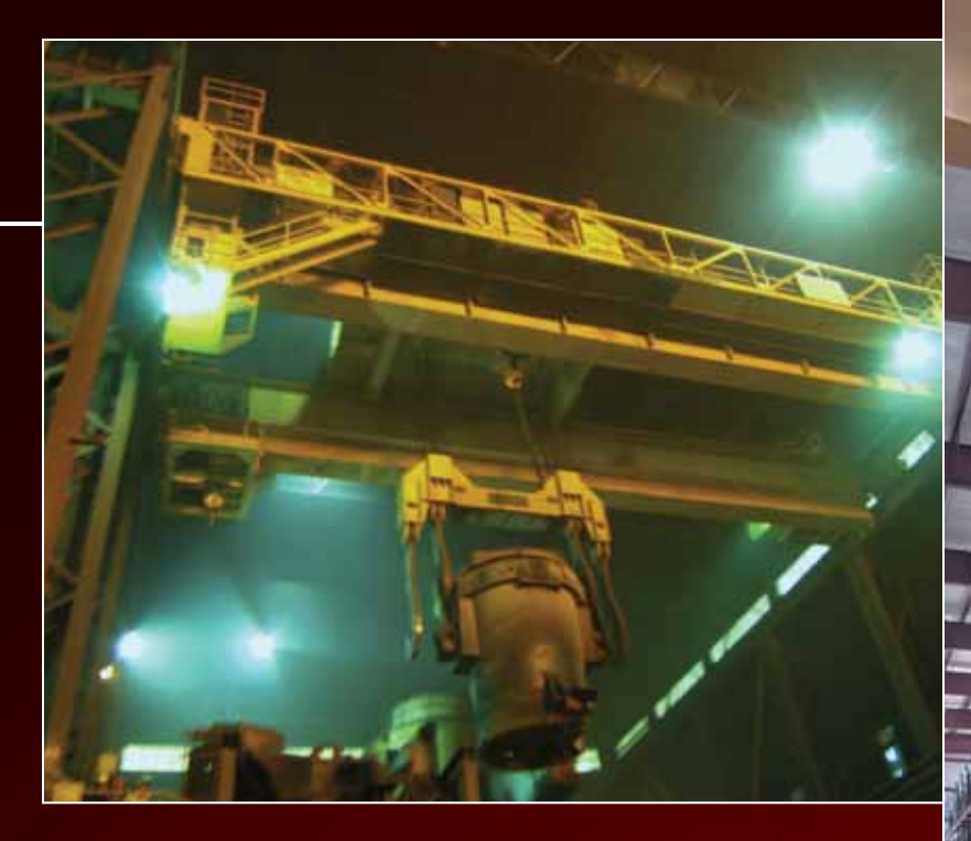
210-ton Ladle Crane with 60-ton Auxillary Hoist