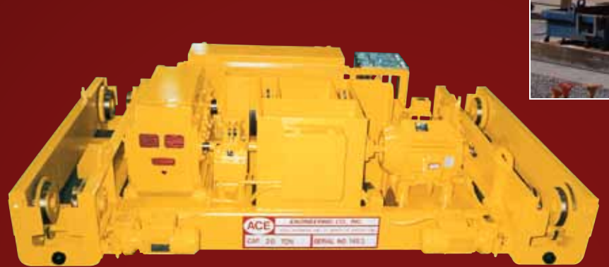
20-ton Class D Built-up Trolley for Underhung Crane