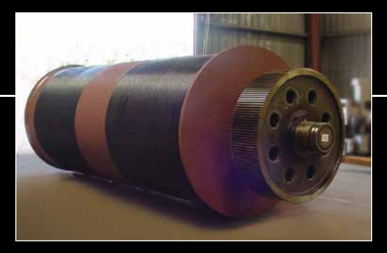
ACE can meet your cable drum needs up to 84" in diameter and 30' long