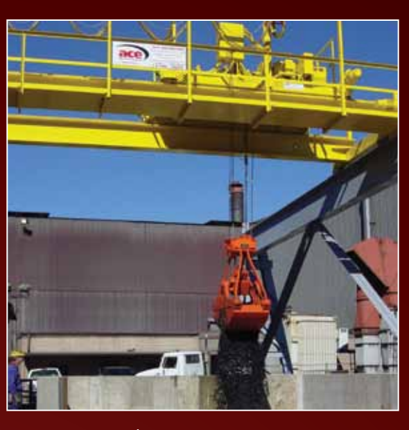
7.5-ton Bucket Crane