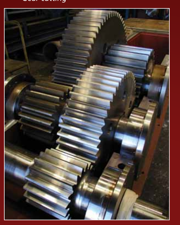
Gear box assembly