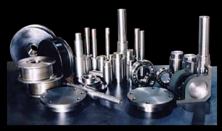
We keep standard parts on the shelf for quick delivery and machine custom parts to customer specifications