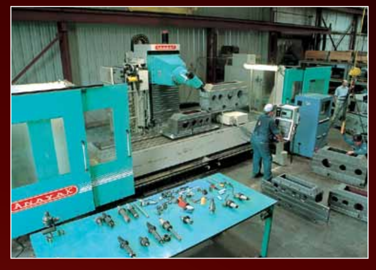
5 Axis CNC Machining Center for precision gearbox manufacturing