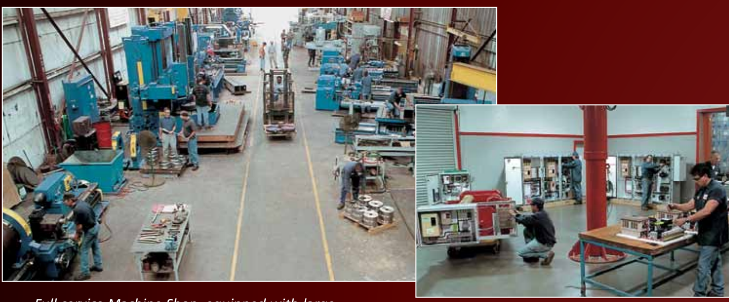
Full-service Machine Shop, equipped with large capacity conventional and CNC equipment to maintain ACE quality standards