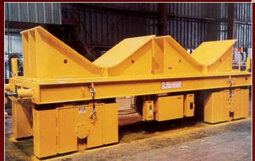
Transfer Car designed with shock absorbing wheel mounts to guard against damage to coils