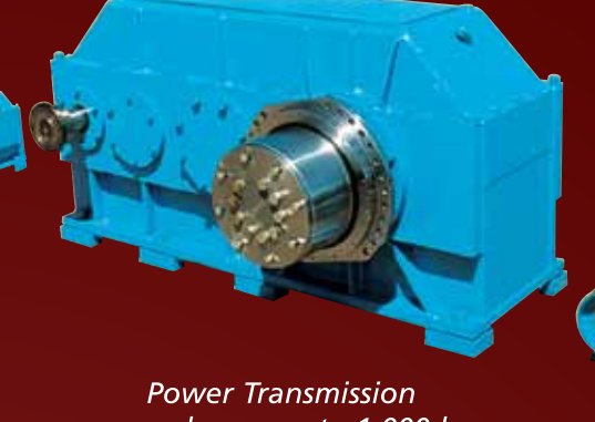
reducers up to 1,000 horsepower or more with through-hardened helical gearing and horizontally split, fabricated steel housings